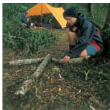
Leave signs of your whereabouts